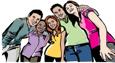
Young People's Ministry

Lent is fast-approaching, and we will soon begin the 40 days of preparation and reflection prior to Good Friday and Easter. Oddly enough, both Ash Wednesday and Lent have always been some of my favorite parts of the Christian calendar, which is certainly a bit counter-intuitive since they tend to be solemn and introspective. However, it's so important to the Christian life to take time to reflect on our lives and the places where we need to repent (literally meaning turn around) and find our way back to God. When we do that, God is always there waiting for us with open arms. To mark the season this year, youth and young adults will each have their own separate studies.